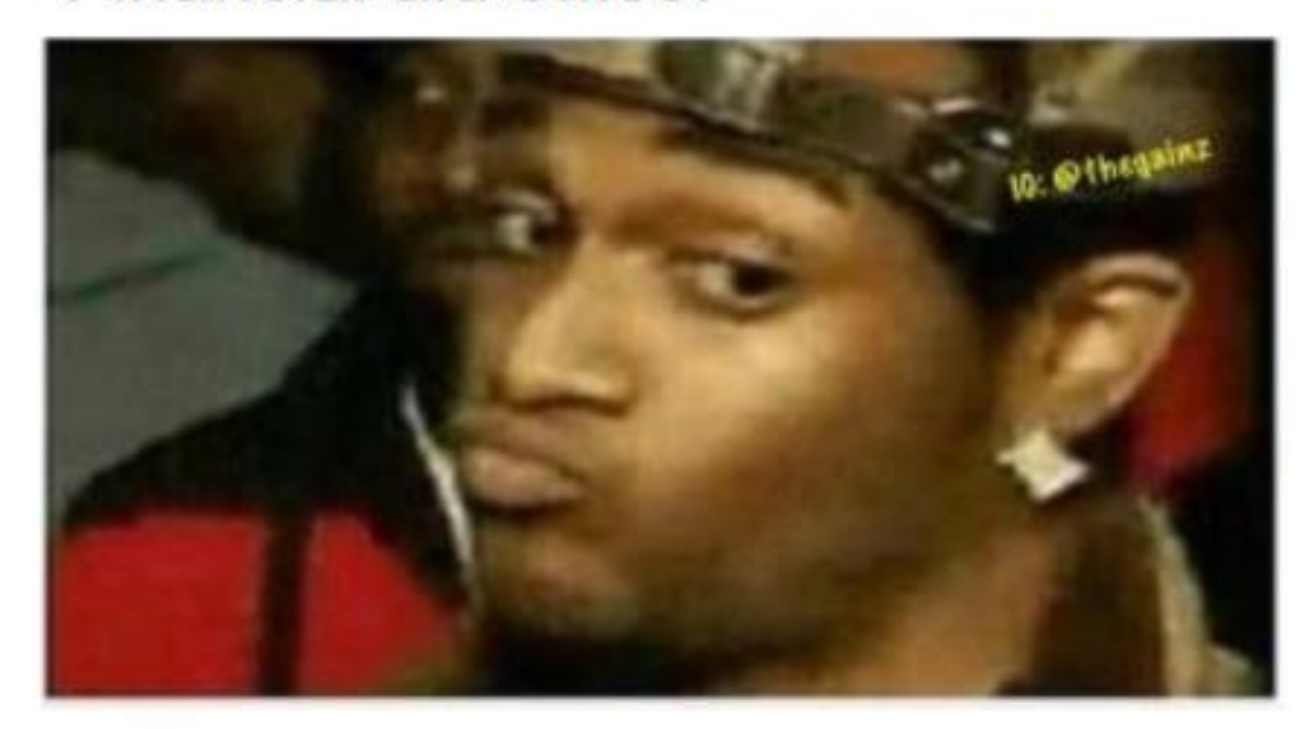
DON'T WAIT!! FILE YOUR FAFSA NOW!! FAFSA DEADLINE OCTOBER 1st, 2018 – MARCH 2nd, 2019